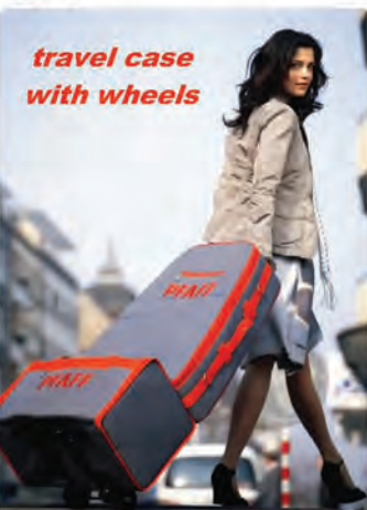
travel case with wheels

Big Foot. Large 8 spool thread stand. Embroidery CD's