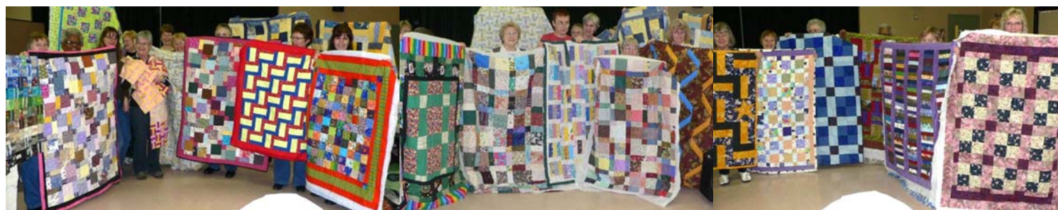
Some of the quilts produced at the January 26 Quilt Bee. Awesome quilters!

Circle method of payment: Cash /Cheque/Master Card/Visa Initialed by: _____