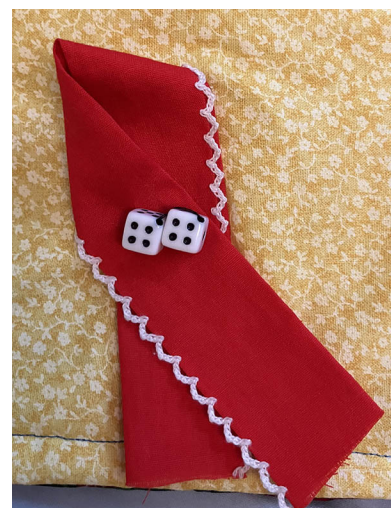
Ideas for Fidget Quilts