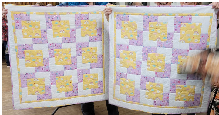
November 19 Show and Share quilts