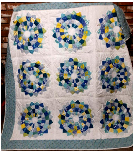
Left: Janet Knecht's Dresden Plate and below: One Block Wonder quilt