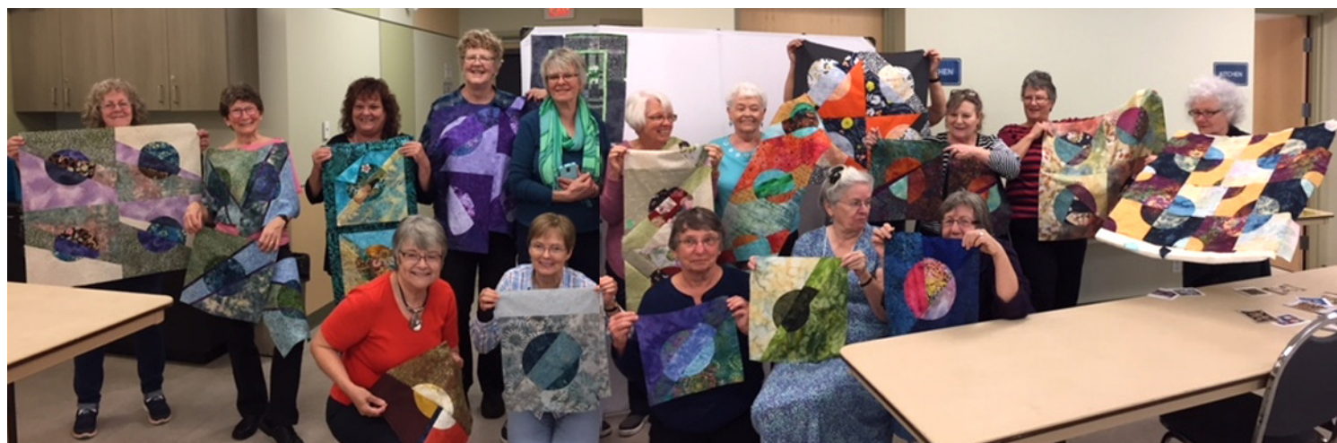
Below: Results of the October 20 Sliced Circles workshop.