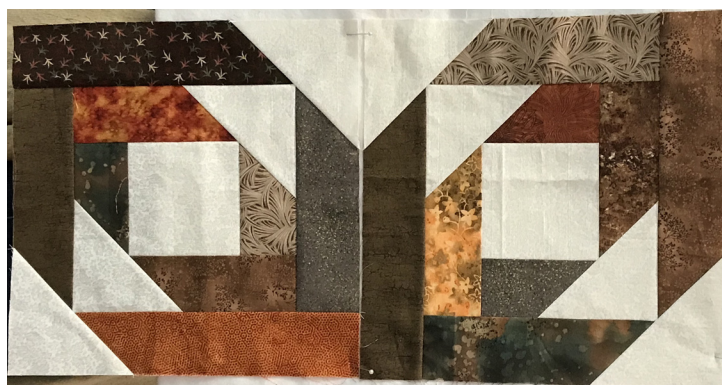
Above: The Pineapple Blossom block for November.