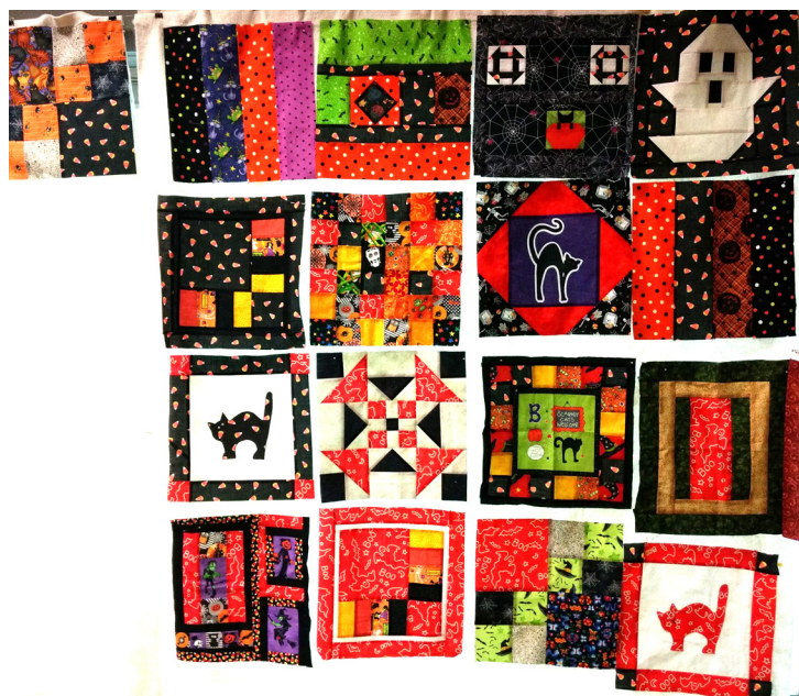
Above: The 17 blocks won by Vicki Zoltay in the evening