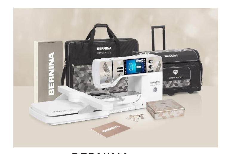
BERNINA 790 Crystal Edition NOW $9999.00 Includes extras valued at over $4600.00!!!