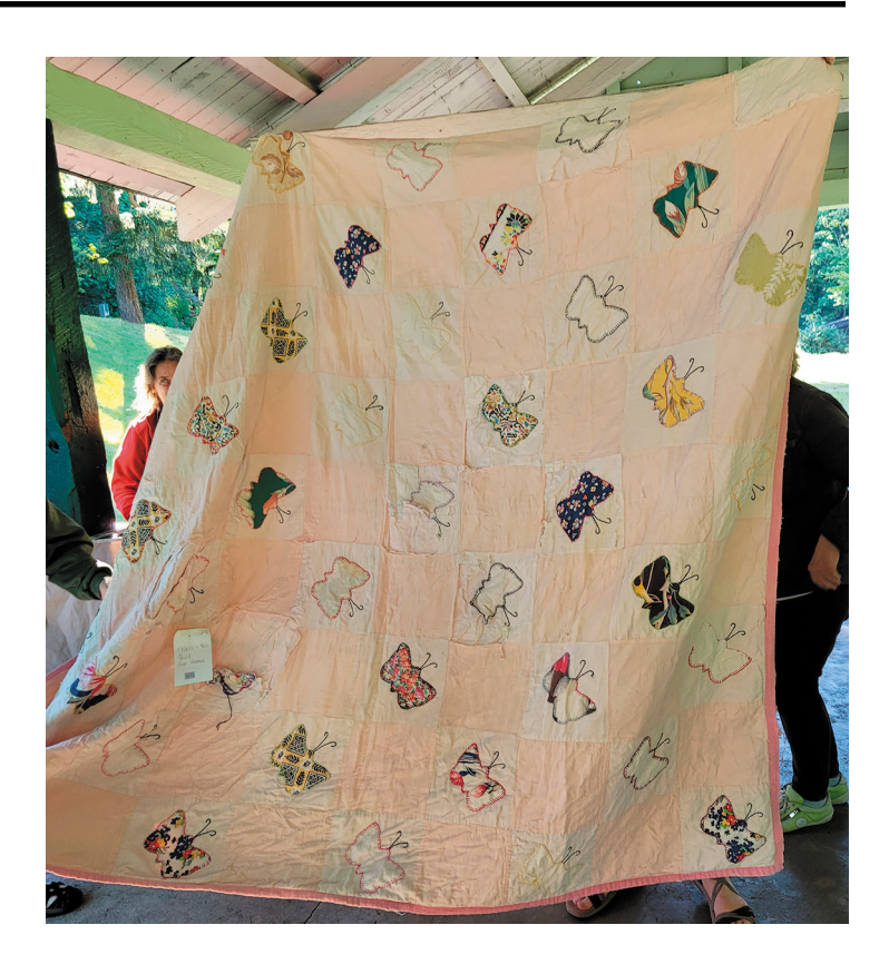
Your One Stop Quilting and Sewing Machine Store on Vancouver Island!