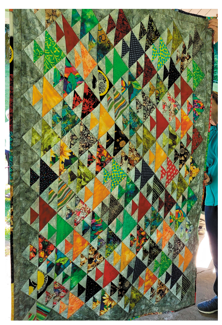
Right: The quilt that won the $250 donated by NQG at Quilt Canada in Edmonton this June