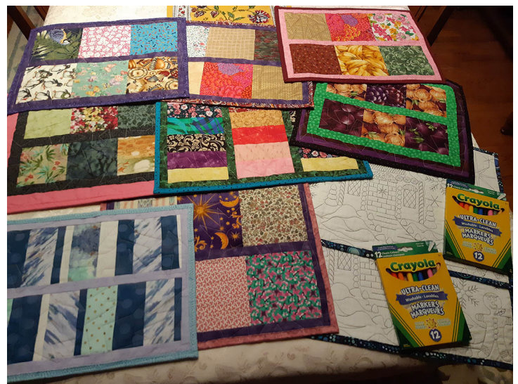
Placemats donated over the summer