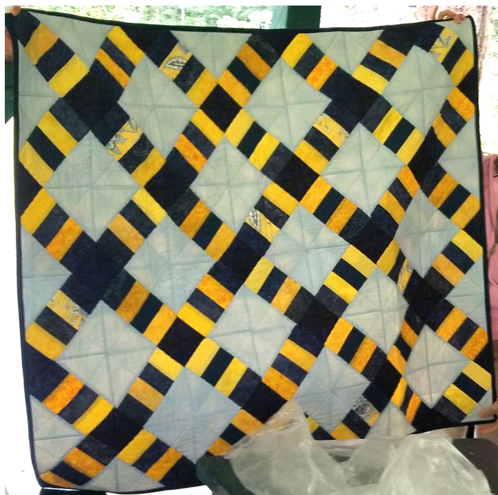
Just 4 of the Show and Share quilts at our June picnic.