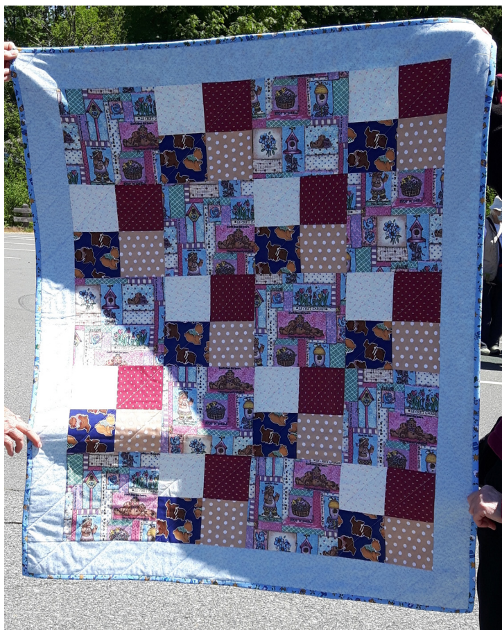
Above: donation quilt .