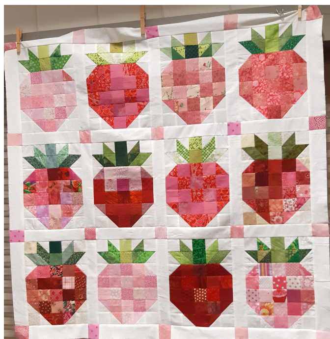
Right: Pam Montgomery finished her quilt top with the 12 strawberry blocks she won last month.