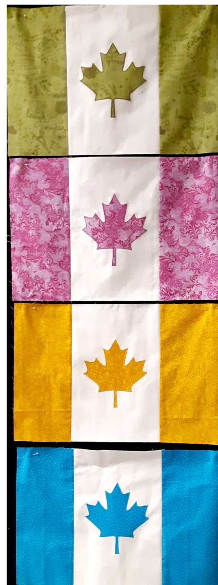
Right: May's Canada Flag block