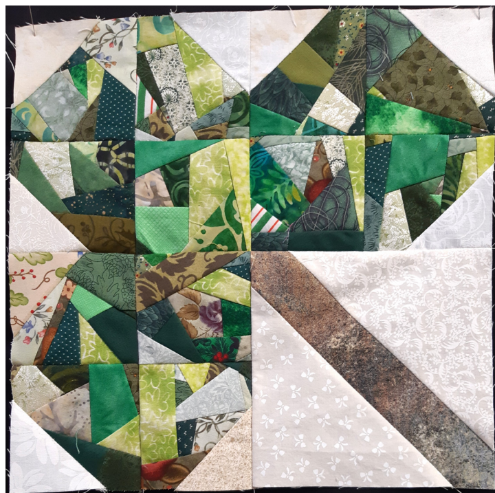
Below: shamrock made with scrappy blocks