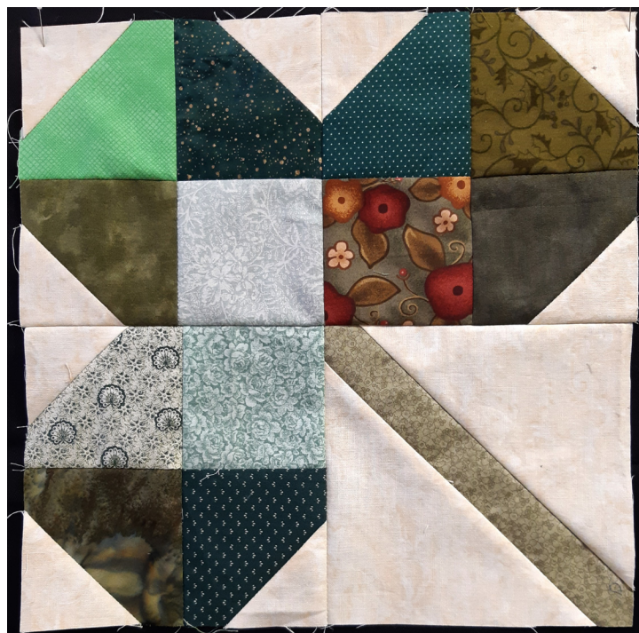
Above: shamrock made with blocks following the directions.