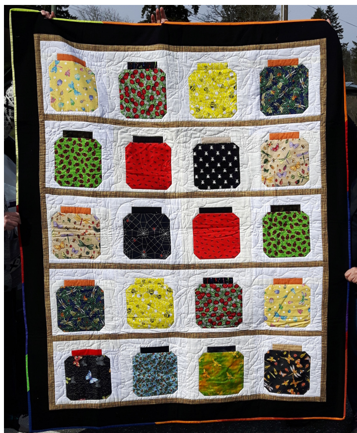
Donation quilt turned in on March 17