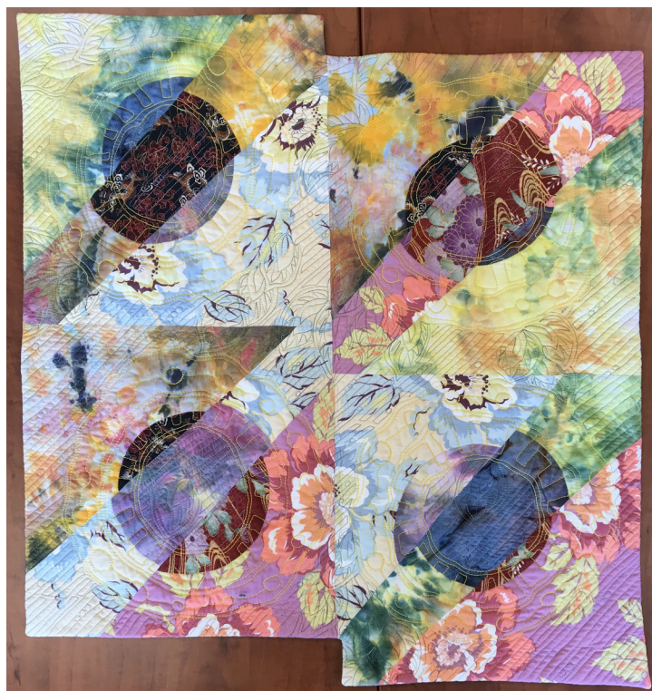
Sliced Circles with Ionne McCauley on October 20

Workshop: Circles are among the most satisfying shapes to work with and the combination of circles and straight lines is exciting! Play with great, favourite fabrics and create a wall-hanging-sized art quilt top, while you learn about shapes and lines and designs. Quilting options are discussed for your finished project.