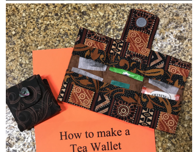
How to make a Tea Wallet