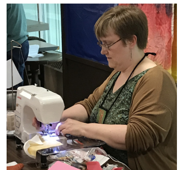
Clockwise from top left: beaded embellishments, pineapple ruler, tea wallet, curved piecing, rag quilt

(tips & techniques in background), hexie folded flowers