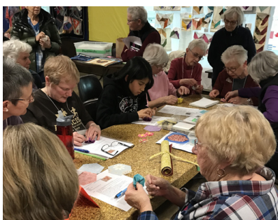
Above: Crazy Quilt Techniques workshop