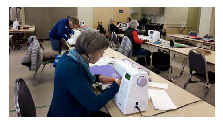
NQG Box 943 Nanaimo BC V9R 5N2