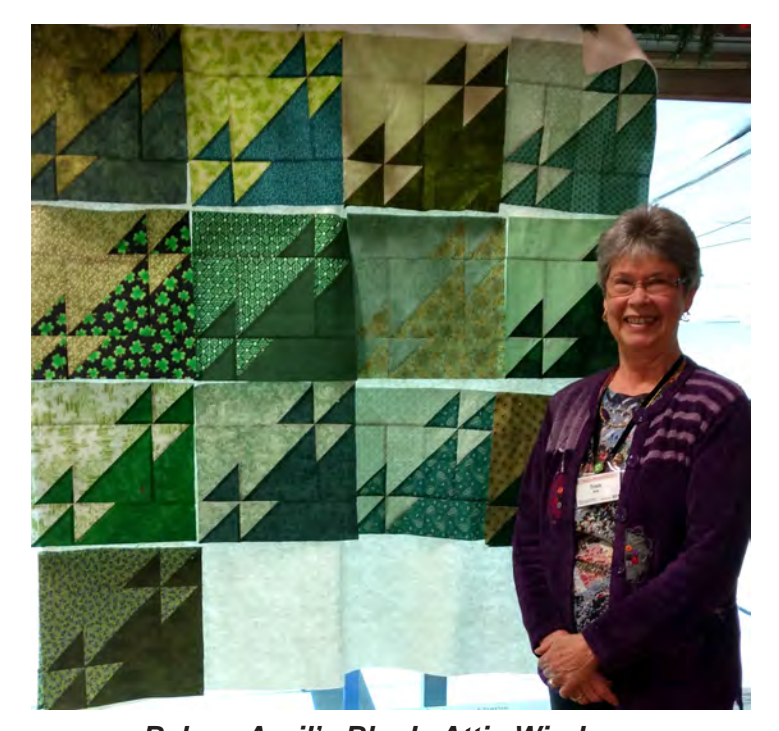
Below: April's Block, Attic Windows