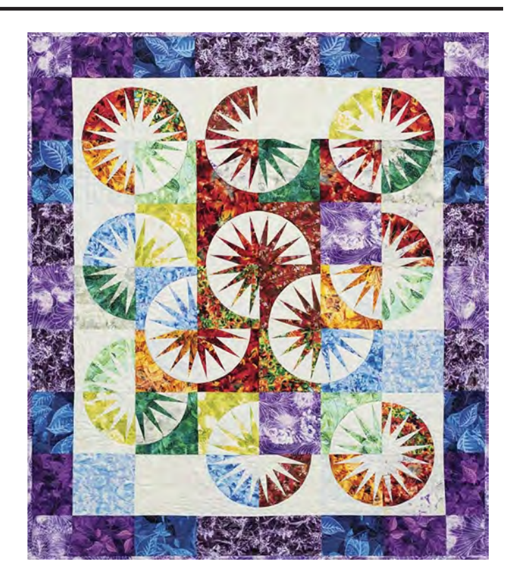
Above: May 13 & 14: Desert Sky Workshop with Anne Hall. Below: April 22: Playing in the Trees with Susan Teece