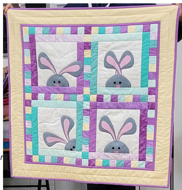
Right: 'Bunny' Show and Share quilt