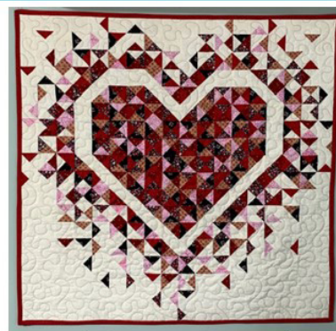
Exploding Heart Patterns is available for purchase