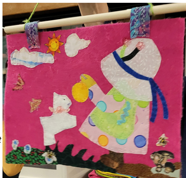
Right: Dana's Sunbonnet Sue wall hanging