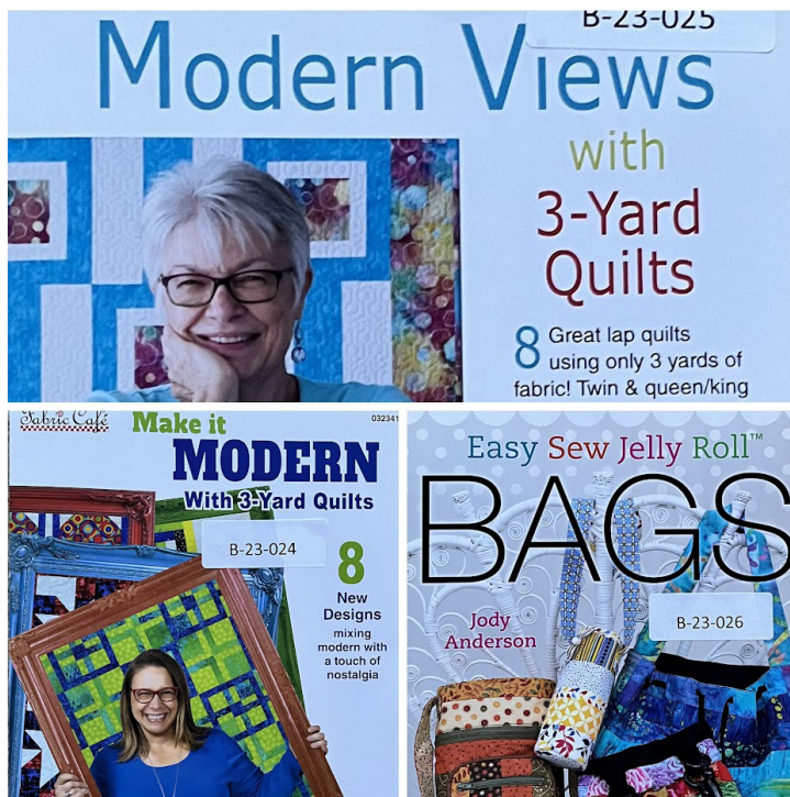
Above: covers of the latest book additions to our library