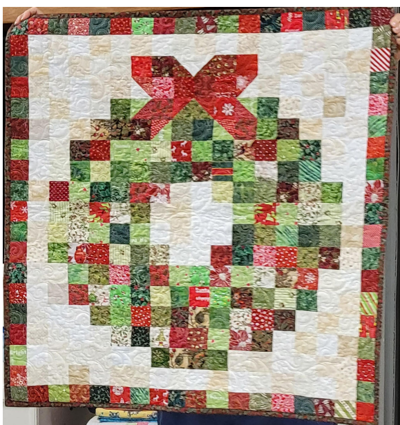
Left: Christmas Show and Share quilt