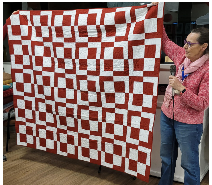
Below: Sue A's Show and Share quilt