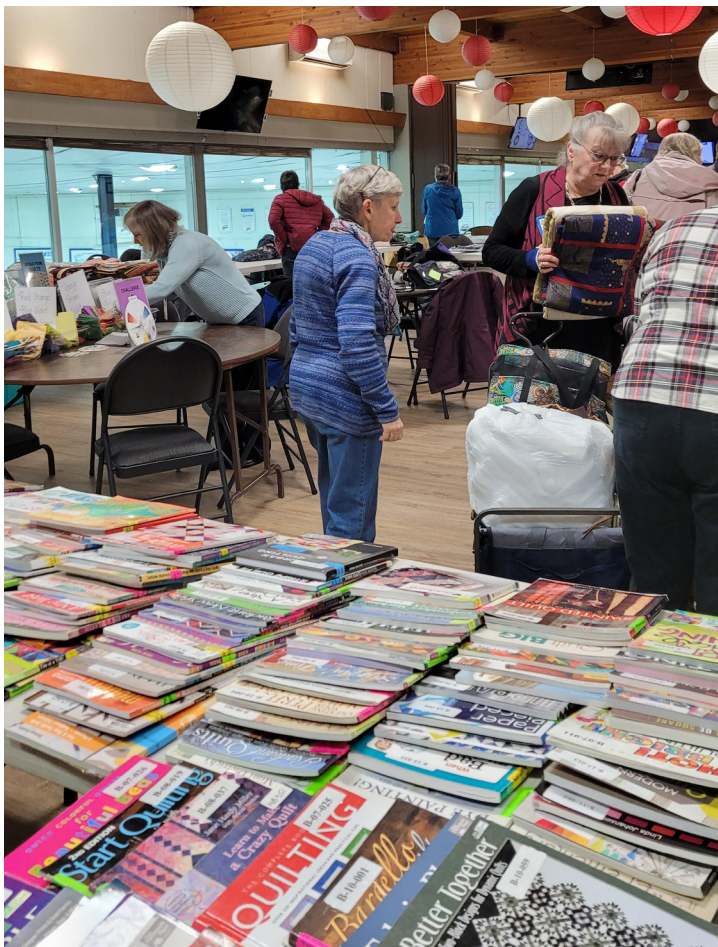
Below: Our February 21 meeting was a busy one. Here is the view from the library.