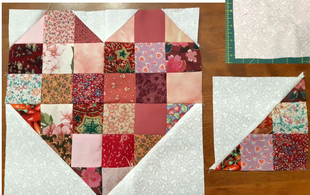
Top: scraps for making blocks, Middle: Scrap layout Left: Finished block and bonus half square triangle block