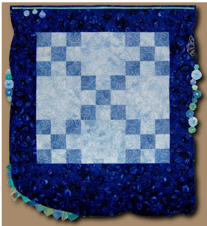
March 18: Finishing Quilts: More than a Straight Edge Workshop with Ionne MacCauley.