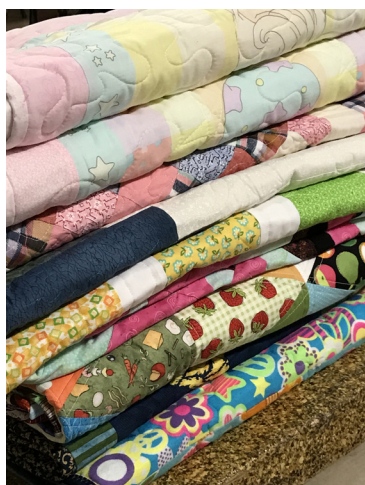
Some of the 124 Quilt Bee quilts donated to Haven House on February 15