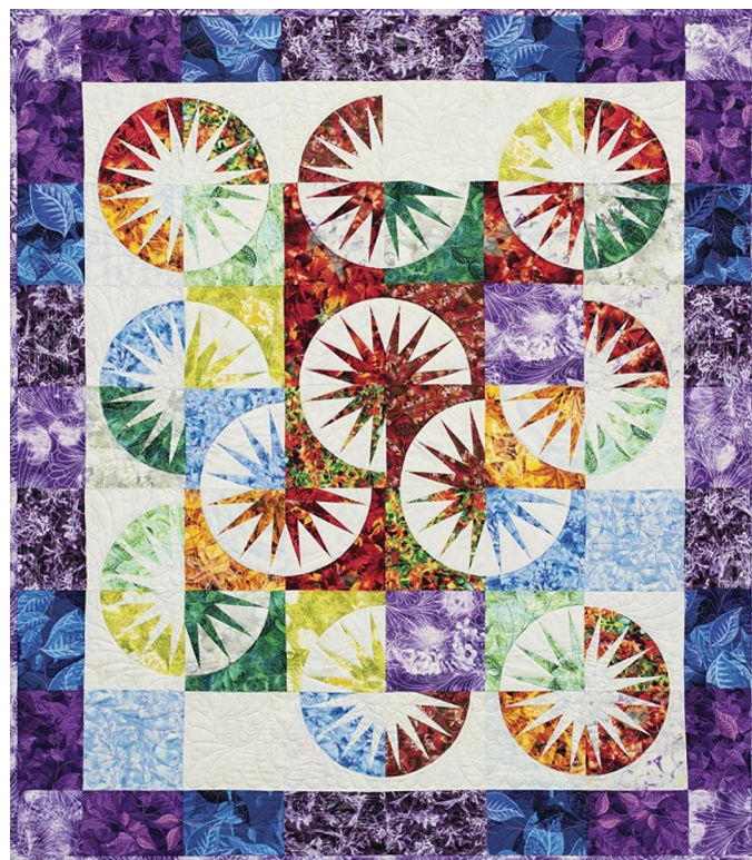
Above: May 13 & 14: Desert Sky Workshop with Anne Hall.