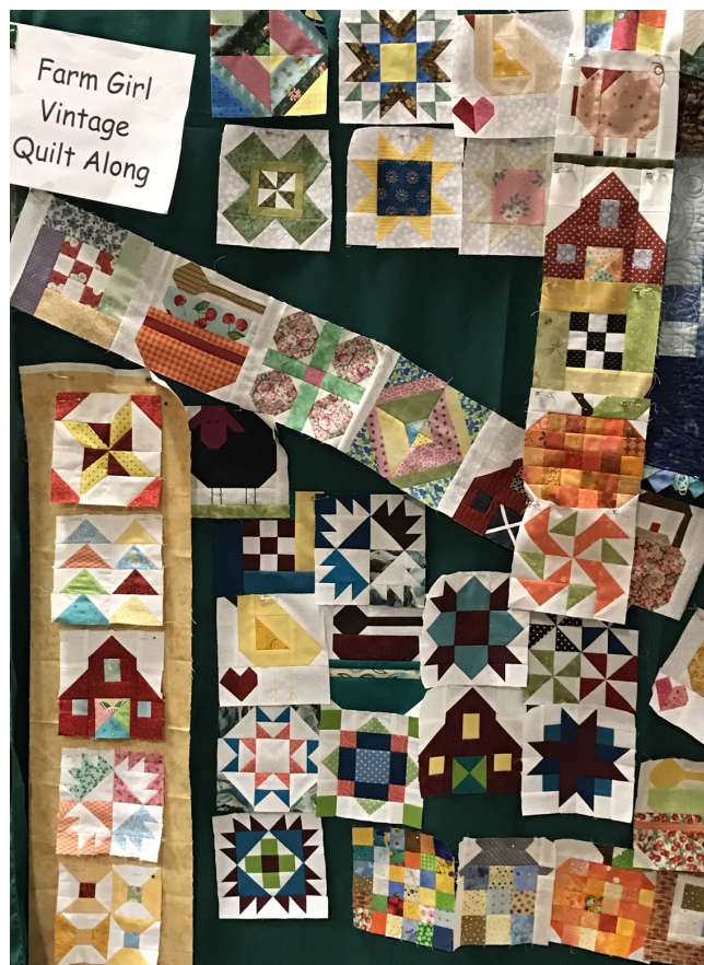
Above: Farm Girl Blocks - February 15 Evening Meeting