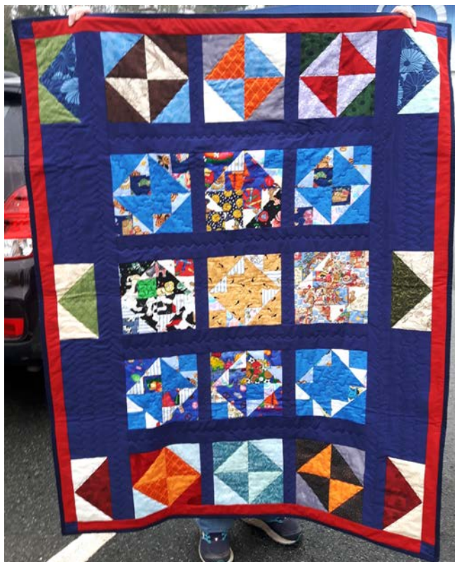
Three of the many beautiful Quilt Bee quilts