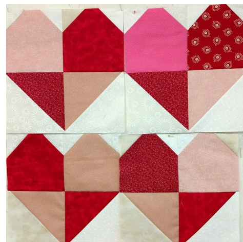
Left: January's afternoon blocks Centre: January's evening blocks Right: February's Happy Heart blocks sample.