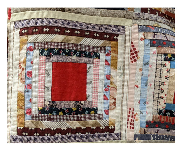
Hand pieced and hand quilted!