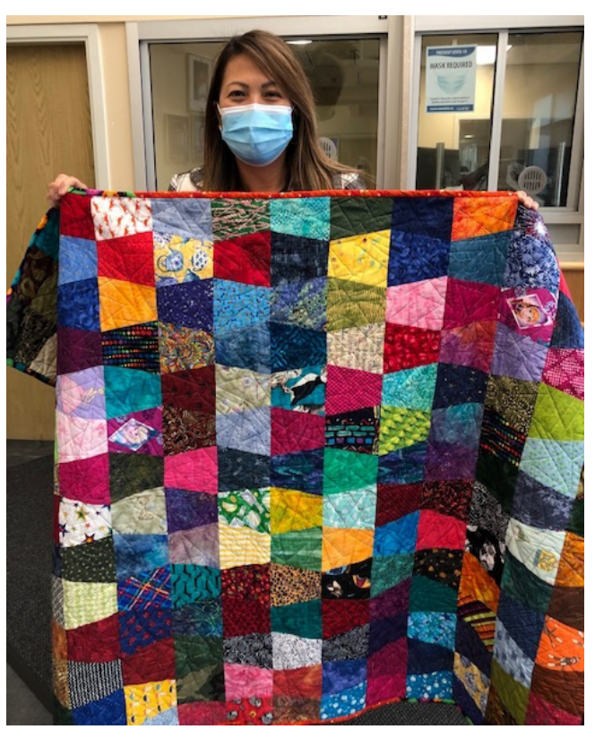
RCMP Victim Services quilt delivery