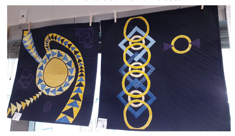
Honourable Mention to Greta Simmons (4th and 5th) Modern Geometric